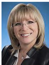
Francine Charbonneau Minister Responsible for Seniors