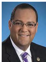
Saul Polo Member of Parliament for Laval-des-Rapides