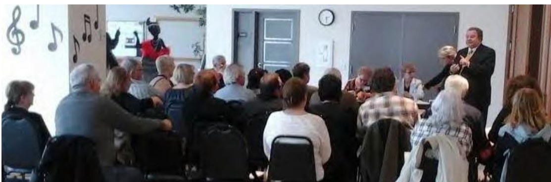
Photo of the Annual General Meeting of 21 September 2014